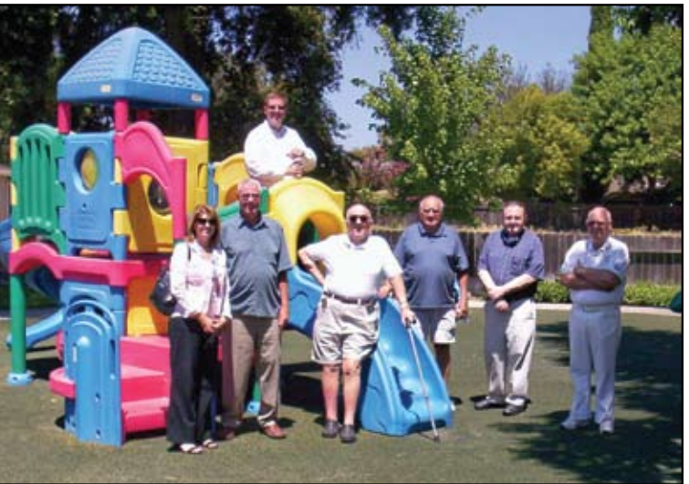
above - The Foothill Highlands Rotary Club had a meeting at the Nursery and then they all took a tour. They have been a great support to the Nursery and have been very generous with their donations.