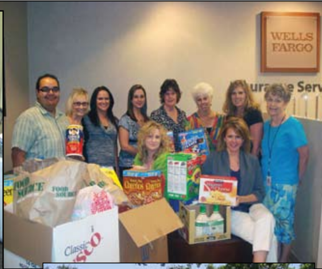
left - Wells Fargo employees all over Sacramento collected food for the Crisis Nursery Program when they heard our cupboards were bare. Most notable was the nearly 400 lbs of food and related items from a group at the Rancho Cordova Wells Fargo Insurance Services office!